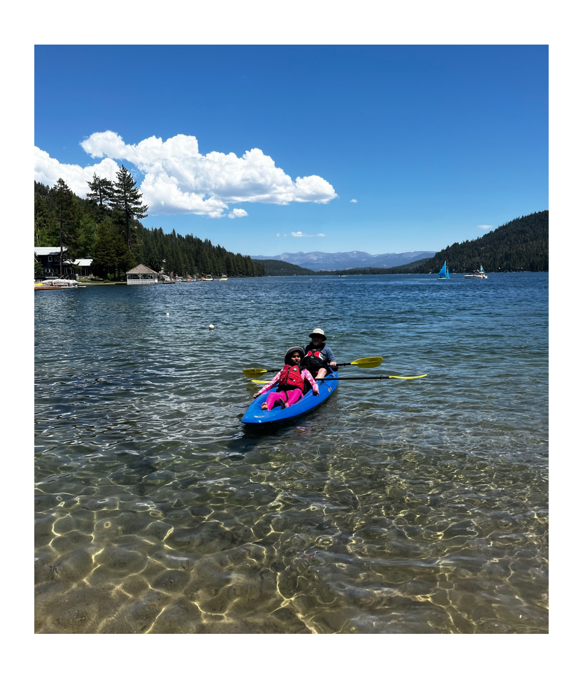
I did Kayaking.