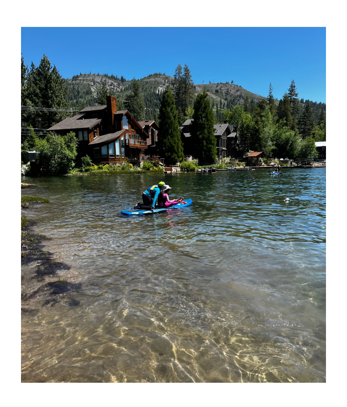
I did Paddle boarding.