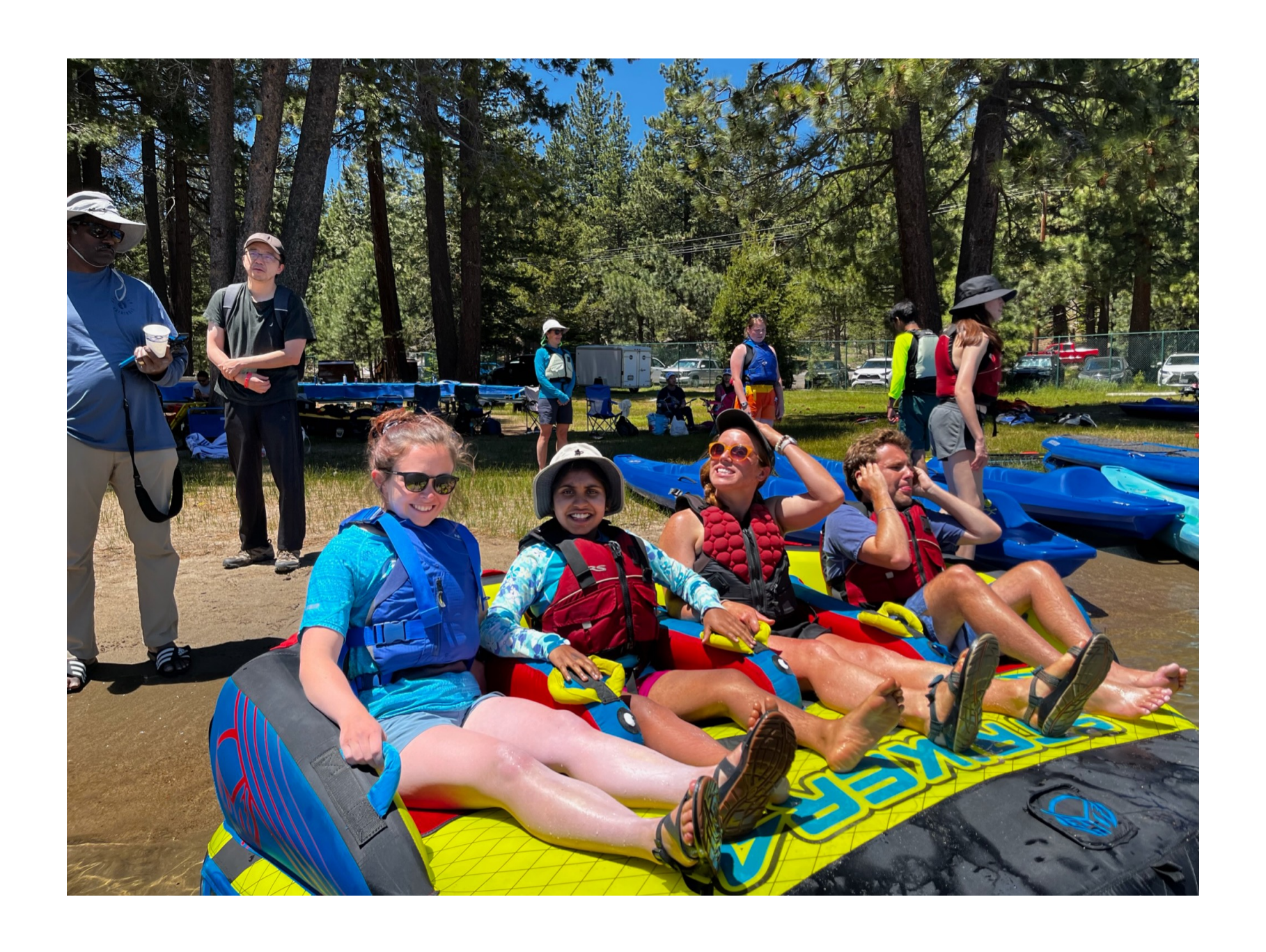
I did tubing. It was one of my favorite sports.