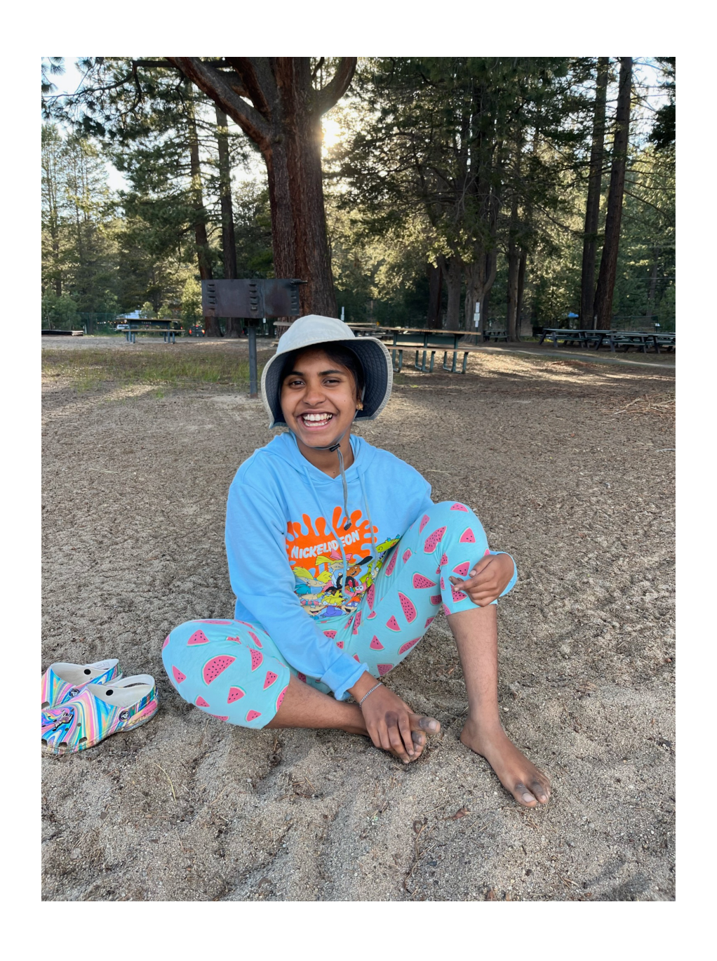
I also had a lot of fun playing at the beach.