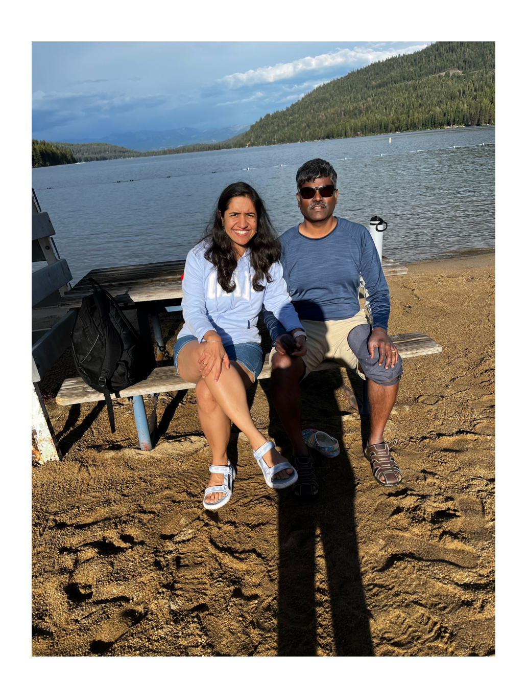
I had a great time with my family.