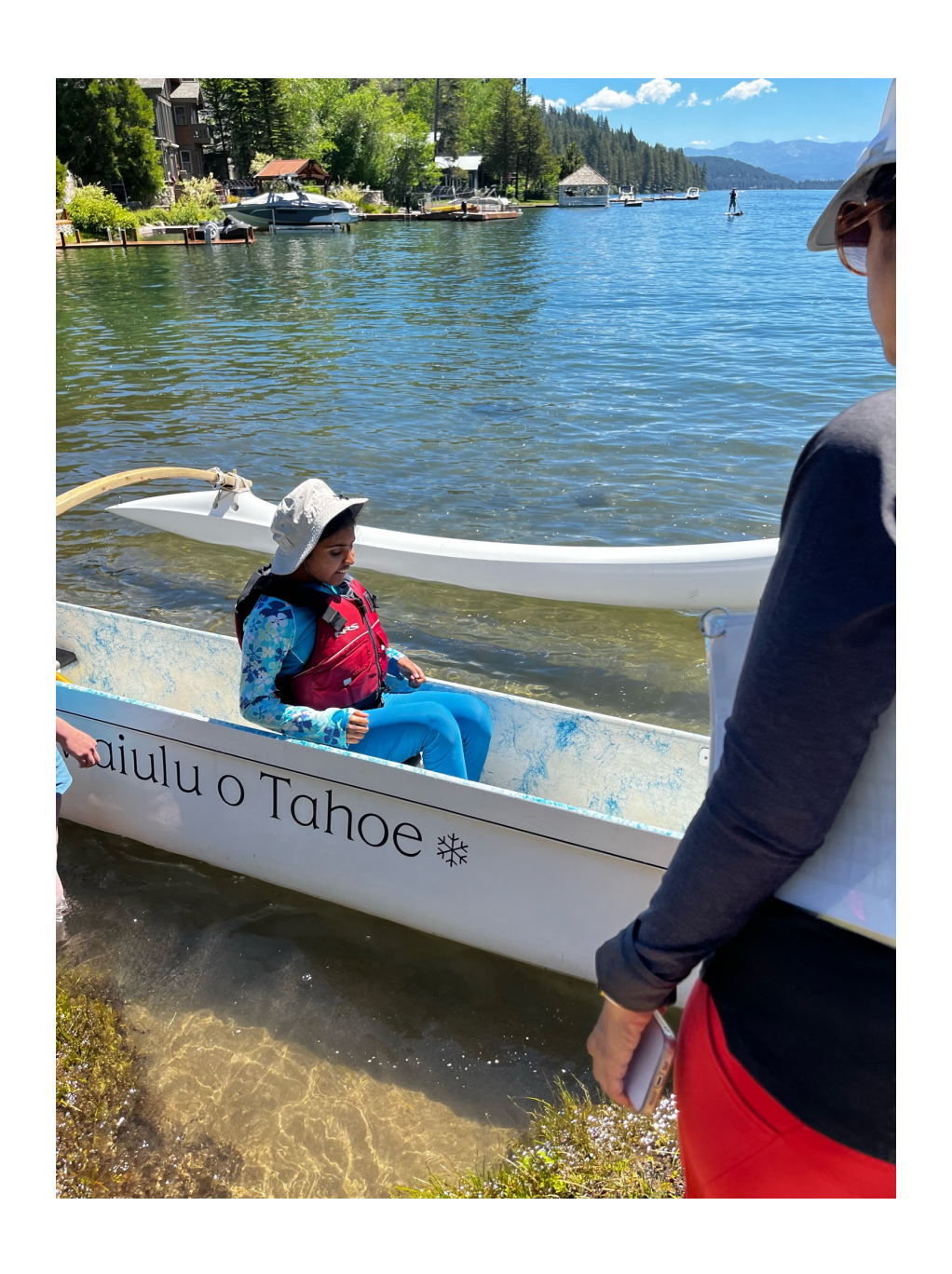
I did Canoeing.